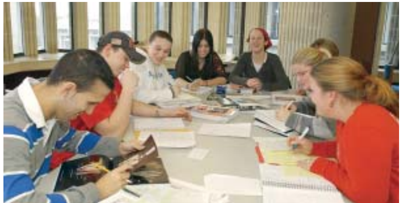
The third floor of the library is a popular spot for study groups.

Having "surf'd the web" for years, many of today's computer-savvy students need to be taught the difference between the "information" available on the Internet and the information provided through the library's collections. Their professors are starting to demand that they learn to weigh the relative merits of information: Where did it come from? Who checked its accuracy and reliability? Who stands behind it?