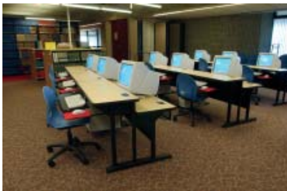
The second floor reference/instruction suite is equipped with twenty-one new computer workstations.

Charlie McNeil, head of Library Systems, summed up the library's technology objectives: "The goal is to provide an ever more seamless approach to accessing information and library services, regardless of the source."